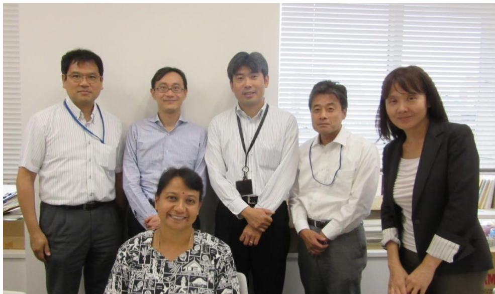
Figure 9: Visha with five senior researchers of Ministry of Education, Sports, Culture, Science and Technology (MEXT).