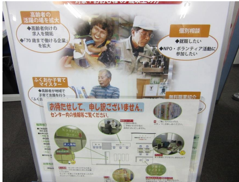
Figure 10: Growth and development for aging society is a lifelong process.

Based on my two categories of educators, I would want to focus on issues of 21 st educators in current times. I am not generalizing that all educators have changed in this 21 st century but the drive for focusing on product and which is not balanced with process which humanities is more concerned with is slowly deteriorating in current times. I have trained hundreds of educators-to-be and given in-house training to those teaching humanity subjects such as Moral Education. I find their moral very low and they have nothing much to say other than complain about the system, how terrible nowadays students are and how frustrated they have become. I find my students in the university who are going to be future educators very enthusiastic about their career. But after several years being in schools, they become like my in-house training educators, complaining practically about anything and everything in their profession.