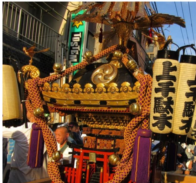
Figure 4: The mikoshi that we shouldered from 3pm to 8pm.

Mikoshi in Japan is a divine palanquin (some translate as portable Shinto shrine). Shinto followers believe that it serves as the vehicle to transport a deity in Japan while moving between main shrine and temporary shrine during a festival or when moving to a new shrine. In our case, the mikoshi was involving a neighborhood matsuri (Japanese festival) and the people involved in bearing the mikoshi were all neighborhood individuals who knew each other. They roped in friends to make the event merrier and give a helping hand in bearing the mikoshi . That's how our Japanese friend roped us in, through her contacts with the local community leaders.