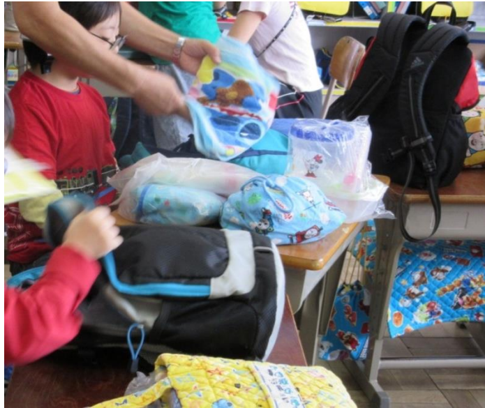
Figure 7: Teacher shows how to fold towel while another student practice packing his bag.

From my experience to the elementary school, a lot can be learnt about the education system in Japan and how the administrators of schools can make a difference if they are more innovative and creative in developing students to be proactive and take charge of their own learning with facilitation from their teachers and content experts.