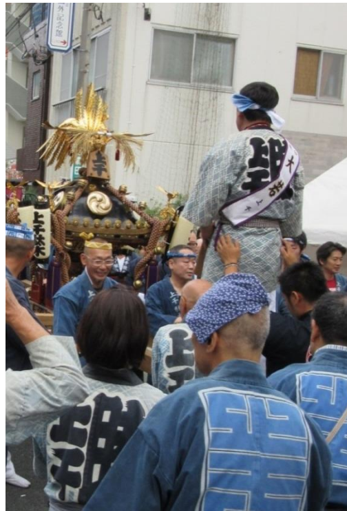
Figure 5: People getting ready to catch the chief as he drops backward.

I only noticed the trust put upon by the chief when I was asked to be the front bearer of the mikoshi . Because of the quick team work that everyone got to carry the mikoshi simultaneously, the chief will just drop his body backward and his whole team is ready to catch him as the mikoshi bearers lift the mikoshi and shoulder it in a split second. It is such a splendid act of responsibility, teamwork and total trustworthiness.