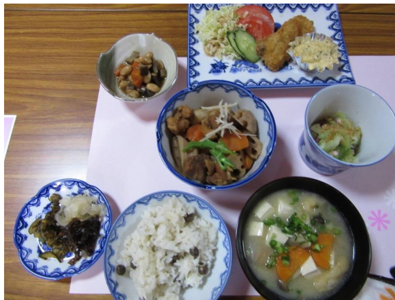
Figure 2: Food prepared by the local senior women with lots of care and love.

The growth and development of the local community here involved the process of empowering the local community to take charge of their own lives, helping them to activate their creativity and indulge in activities that make them feel useful, responsible and dignified. It was such a joy to see the local senior women cooking a nice lunch for us and how delighted they were to pack onigiri (rice balls) for us to take back. They were very happy preparing the meal as a team and we felt honored to be served by such respectful citizens of the local community. Even the Mayor joined us for lunch in spite of his hectic and busy schedule. It all goes without saying how communal support can help in the growth and development of the local community.