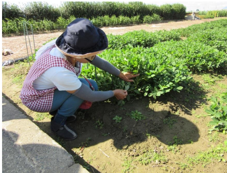
Figure 3: A farmer showing her peanut farm which is almost ready to harvest.

When we visited the farms, the women farmers proudly showed their farming produce such as lettuce and peanut. They were explaining thoroughly how they went about multitasking, between their role as a house wife, preparing meals for the family and then spending about six to eight hours in the farm. This was such a challenging task which the women of Tachiarai shouldered proudly. We met only the women and when one of my colleagues asked where their husbands were, they responded that they were doing work at home. We did see some men clearing plots of land using the tractor. As for their children, if they are around, they usually come and give a helping hand during the weekends.