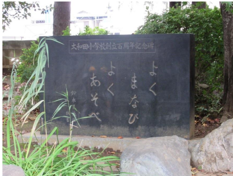
Figure 6: Yachiyo-Shiritsu Owada Elementary School entrance.