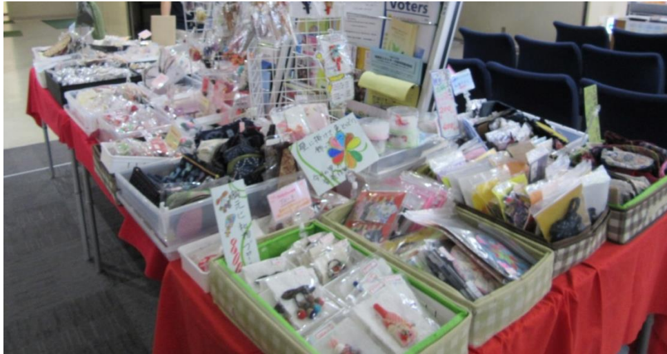
Figure 1: Items made by the local community for the Sakura market.

The growth and development of the local community here involved the process of empowering the local community to take charge of their own lives, helping them to activate their creativity and indulge in activities that make them feel useful, responsible and dignified. It was such a joy to see the local senior women cooking a nice lunch for us and how delighted they were to pack onigiri (rice balls) for us to take back. They were very happy preparing the meal as a team and we felt honored to be served by such respectful citizens of the local community. Even the Mayor joined us for lunch in spite of his hectic and busy schedule. It all goes without saying how communal support can help in the growth and development of the local community.